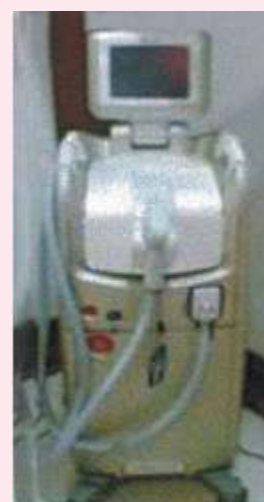
CO 2 Laser machine- Dreampulse

Minimal time taken is about 15 minutes*.